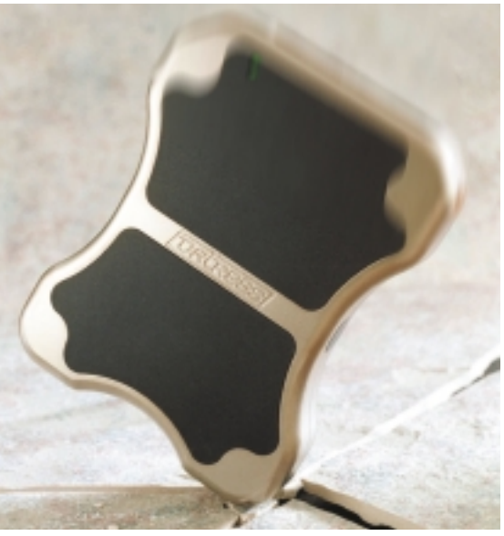
The Fortress storage solution can survive a 6foot drop on to concrete.

To a photographer or graphic artist working with digital files in the field, there is no greater fear than losing data. Two new storage products on the market bring helpful features to today's imaging professionals. A mobile bus-powered hard drive storage solution from FORTRESS CORP. gives users extreme shock