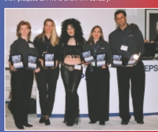
Epson garnered the most awards of all the 2002 entrants with six Cool2s.

Only in Vegas! A Cher look-a-like presented PEI 's Cool<sup>2</sup> award winners with their plaques at PMA's show in February.