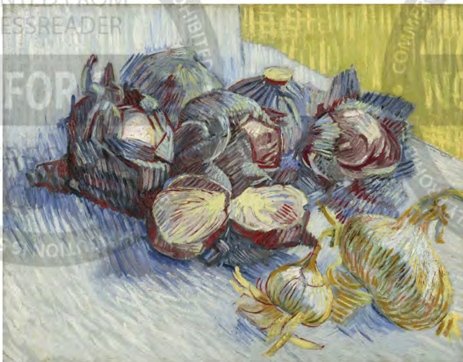
1. Red Cabbages and Onions , 1887, Vincent van Gogh (1853–90), oil on canvas, 50.2×64.3cm. Van Gogh Museum, Amsterdam