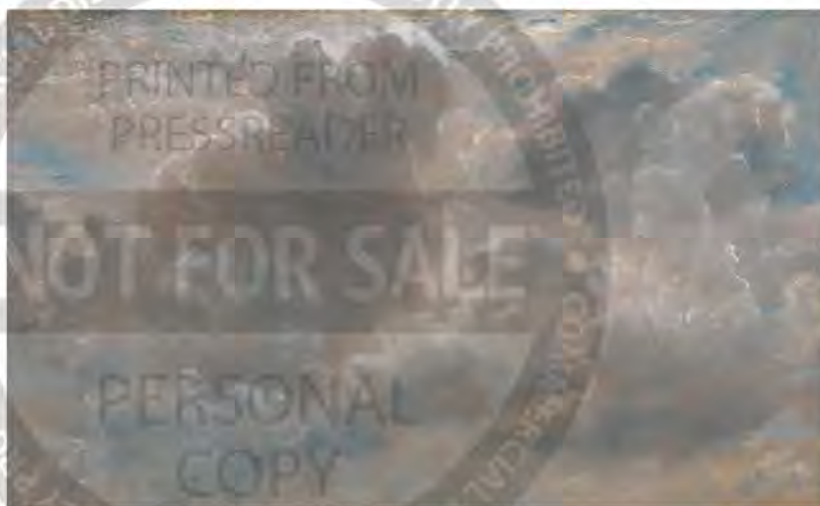
3. Cloud Study , 1822, John Constable (1776–1837), oil on paper laid on panel, 30.5 x 50.8 cm. Yale Center for British Art, New Haven

proposed by Kurt Badt, that Constable was referring to Luke Howard's nomenclature system for clouds, created in 1802. George Young, a meteorologist at Penn State, was called upon to categorise the works of Constable, and those of other landscape painters including Eugène Boudin and David Cox, according to four main cloud types. An algorithm trained by Wang then learnt to classify a large dataset of photographs of clouds, according to these types, with high accuracy. When the team then put images of the paintings through the algorithm, it was able to assess how accurately it could confirm Young's labels. From this it inferred the degree of realism exhibited by each artist as compared with the photographs.